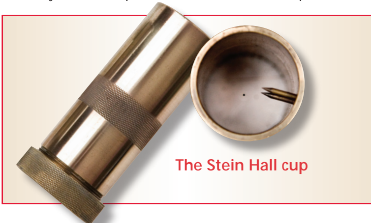
The Stein Hall cup

The Stein Hall cup should be preheated with the adhesive before the actual test is performed. It has a wall thickness of 3/16" solid brass that, if colder than the adhesive to be tested, will cool off the sample before the test is complete. This will give an inaccurate measurement. When filling the Stein Hall cup with adhesive, the adhesive should be strained through a kitchen strainer to remove any debris that could plug up the 1/10" hole the adhesive must pass through. The operator will measure the time the adhesive takes to drain out of the cup, starting at the top pin in the cup, and ending at the bottom pin. The resulting measurement should be recorded as seconds Stein Hall.