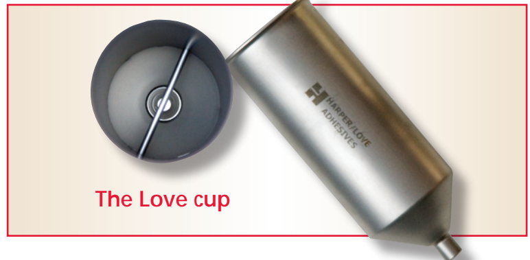
The Love cup

There are two acceptable methods to measure the starch adhesive viscosity in a box plant: the Love cup or the Stein Hall cup. Both cups measure the adhesive flow through an orifice over time.