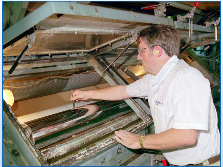
Since 1978, Harper/Love technical resources have helped progressive corrugating operations become more competitive through unprecedented productivity, superior quality and dramatically reduced waste.

All these issues with the starch adhesive and corrugator equipment are a direct result of colder weather lowering the temperature in the plant and the temperature of the incoming water, below the norm of the rest of the year. If you are already experiencing any of these issues or have not made winter formula adjustments, now is the time to have your starch adhesive supplier's technical service representative adjust the formula accordingly and conduct a heat audit to identify any equipment or process issues that need to be addressed.