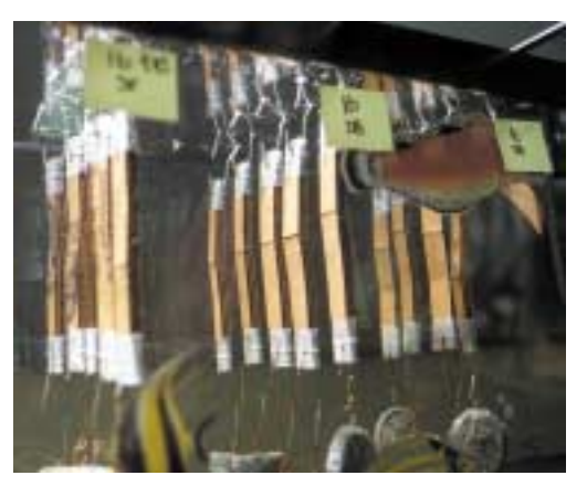
FEFCO #9 test