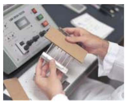
Dry pin adhesion test