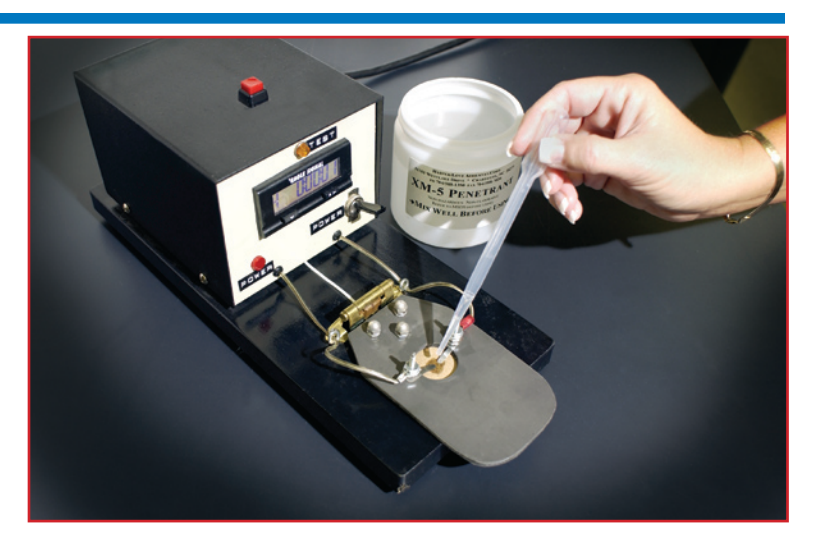
Our laboratory uses an electronic timer to measure penetration of liquids through various substrates. This sample combination stopped the timer at one second.