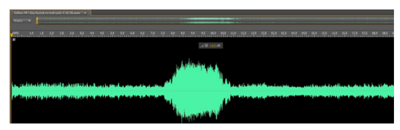
Graph of a bucket trap. Note the marked change in the middle of the graph when the trap cycles.

Ultrasonic technology is also useful for determining if a valve has closed completely or if it is still allowing any degree of flow. This would include things like solenoid valves that are part of a bank of valves or if a check valve is really doing its job. A fully closed valve produces no sound.